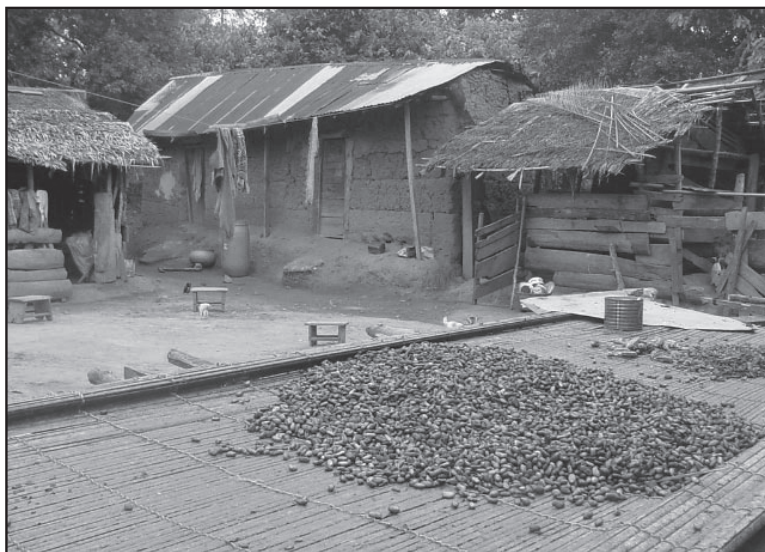
Left: Cacao beans drying at a farm in Ghana, West Africa.

Direct Trade chocolate companies buy directly from the farms that produce the beans, and they maintain very close ties with these farmers. Some even utilize a third